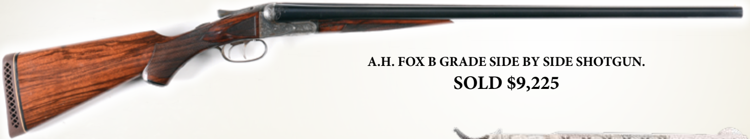
A.H. FOX B GRADE SIDE BY SIDE SHOTGUN.