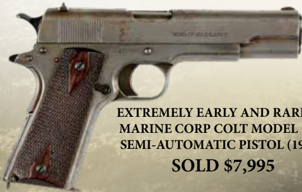
EXTREMELY EARLY AND RARE U.S. MARINE CORP COLT MODEL 1911 SEMI-AUTOMATIC PISTOL (1913).