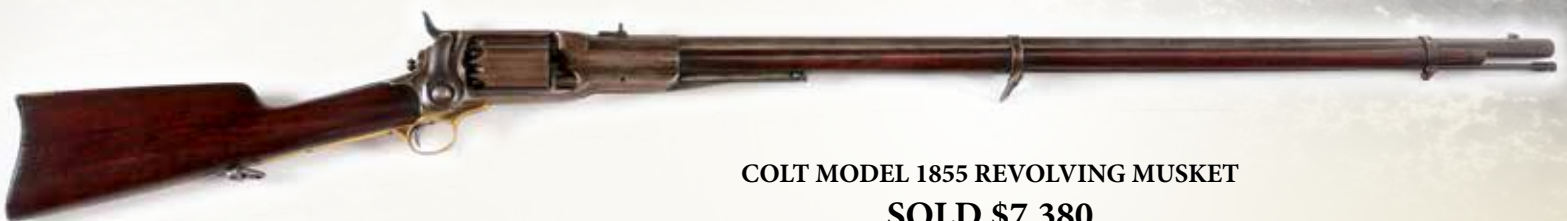
COLT MODEL 1855 REVOLVING MUSKET