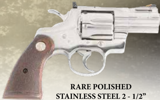
RARE POLISHED STAINLESS STEEL 2 - 1/2" COLT PYTHON DOUBLE ACTION REVOLVER.